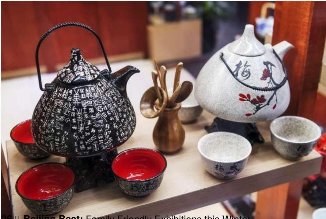
28 □ Beijing Rest: Family Friendly Exhibitions this Winter