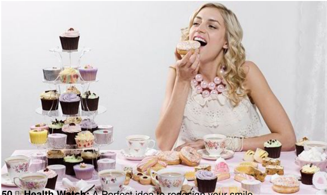
50 □ Health Watch: A Perfect idea to redesign your smile