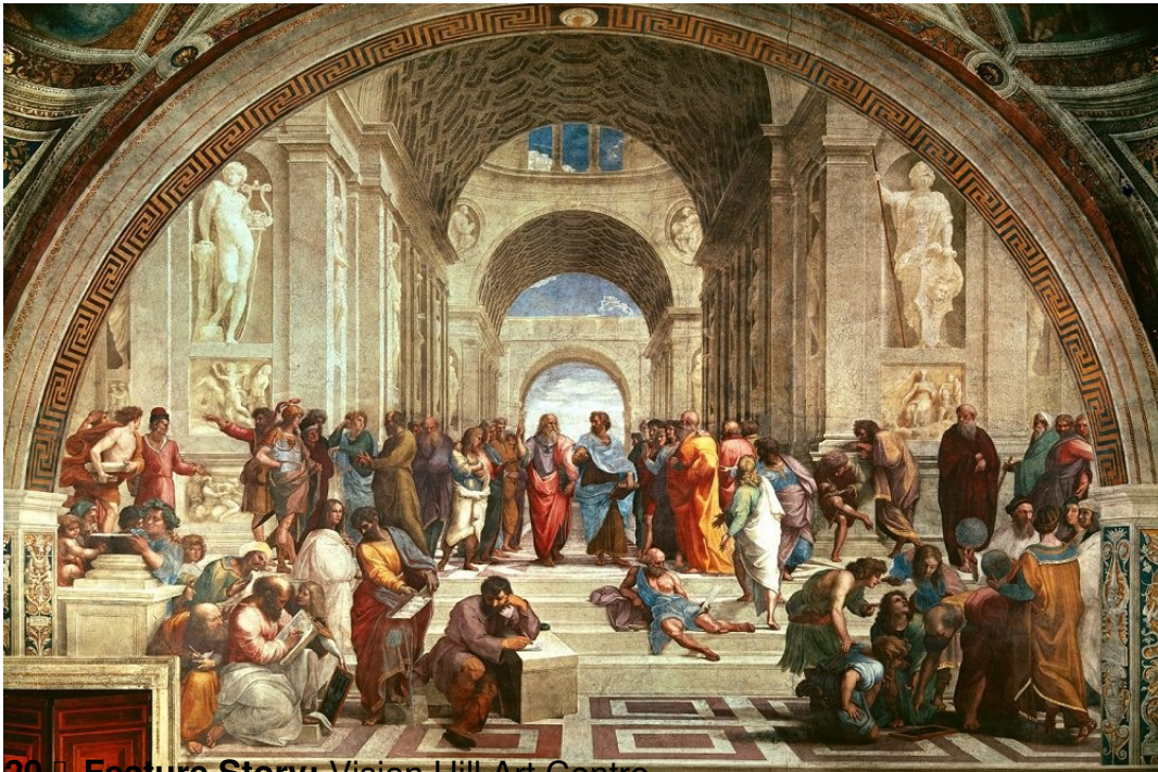
20 ▣ Feature Story: Vision Hill Art Centre