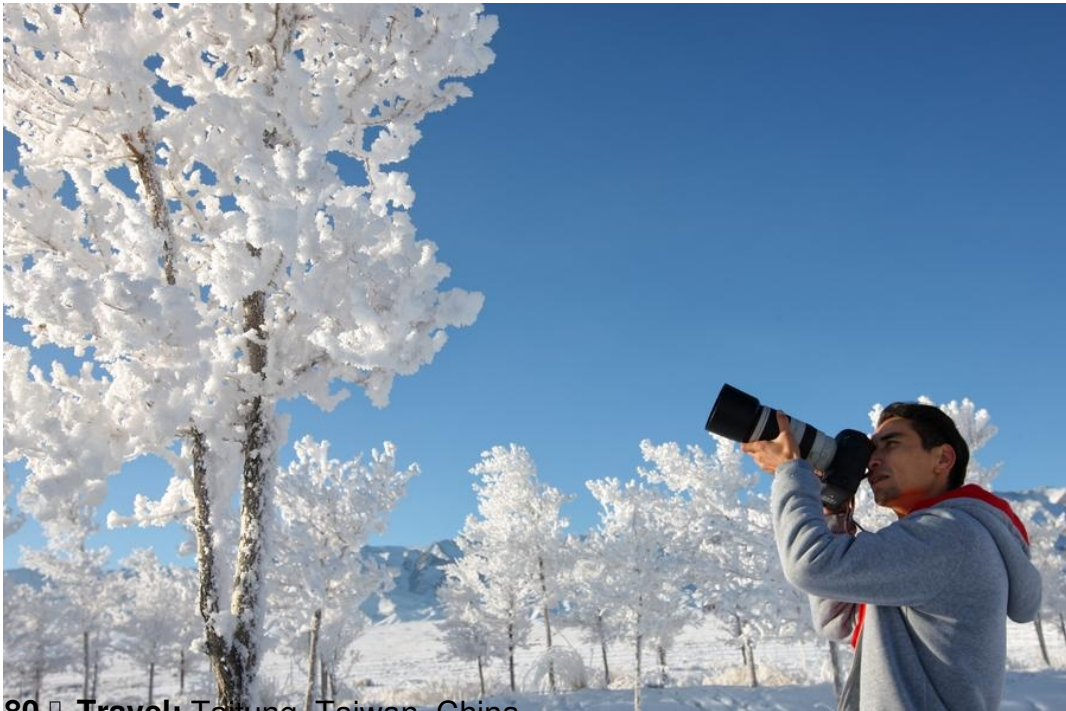
80 □ Travel: Taitung, Taiwan, China