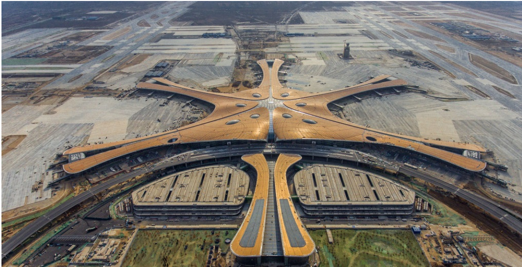
Aerial photo shows Beijing Daxing International Airport

Construction of a traffic network surrounding Beijing's new airport on the southern outskirts has gained momentum before the aviation hub is scheduled to start test operations by September 2019.