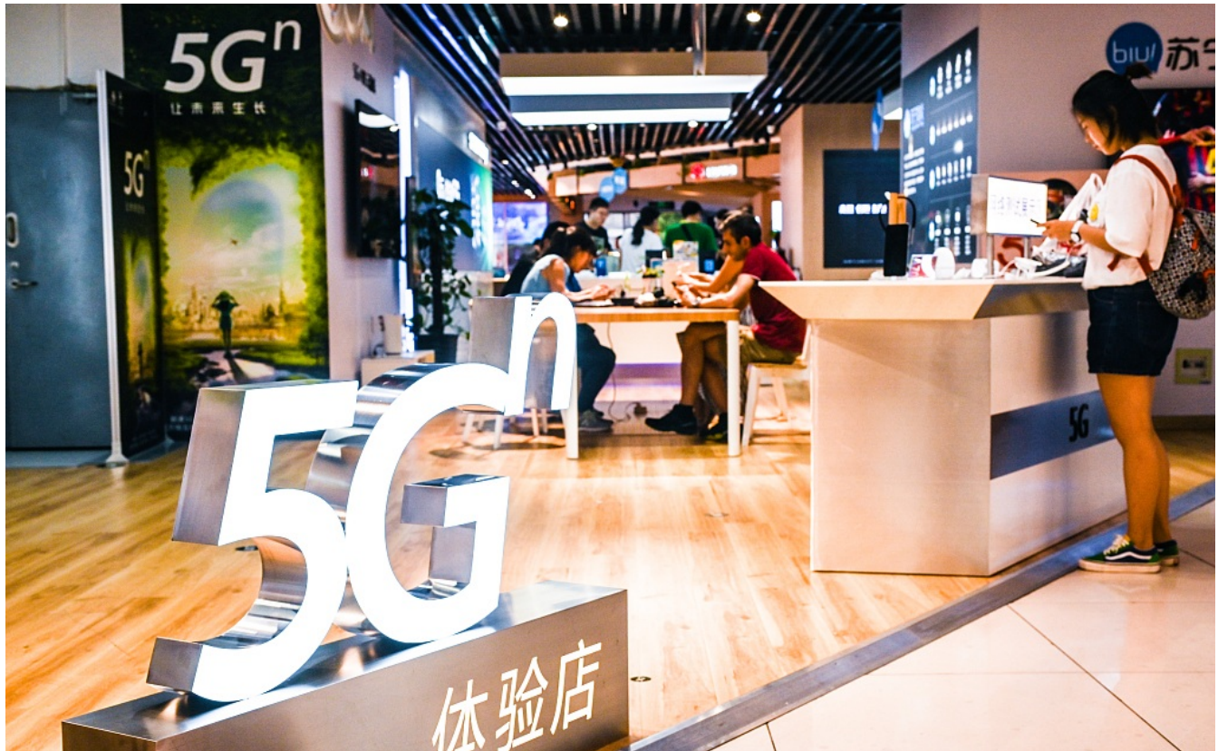
Customers experience 5G-enabled mobile phones at a store in Shanghai on June 30, 2019

You may have heard news about how China has been cornering a substantial chunk of the world's strategic minerals and metal supply crucial for producing new technology. That includes lithium, copper, manganese, rare earth used in everything from electric cars to smartphones. Now, a recent forecast says that China is on its way to becoming the world's largest 5G market with 460 million users of the next-generation super-fast network by 2025.