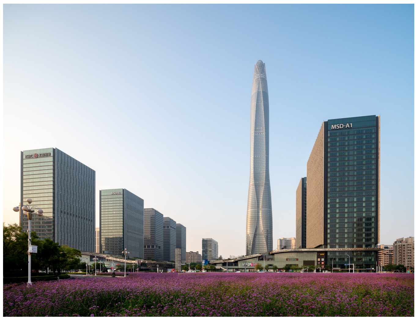
The Tianjin CTF Finance Centre is being developed by New World China Land Limited, the flagship China property arm of Hong Kong-listed New World Development Company Limited and an early Hong Kong pioneer entering the China property market.

The addition of the Tianjin CTF Finance Centre, which is 530 m tall, is expected to play a dominant role in the area to create a prosperous, liveable, smart environment for businesses and the society.