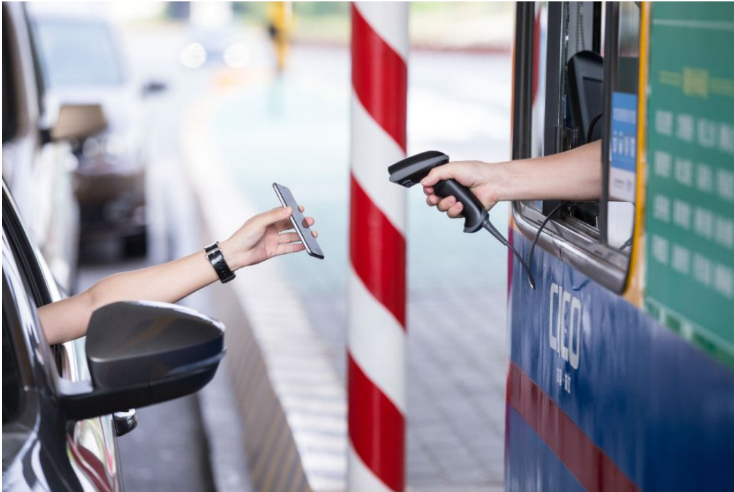
A driver uses his smartphone to pay the highway toll by way of Alipay

Mobile payments are taking hold in China, even at toll booths. From 10th September, Tianjin enabled cashless transaction on highway tolls across the city.